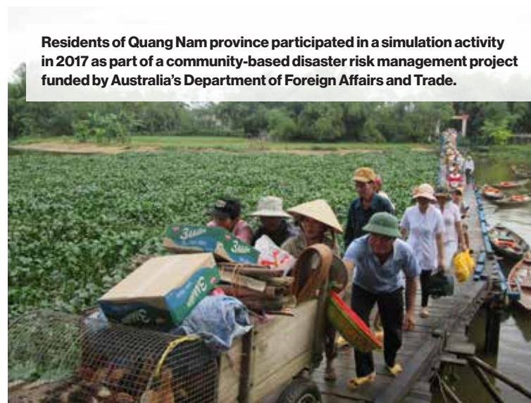
Residents of Quang Nam province participated in a simulation activity in 2017 as part of a community-based disaster risk management project funded by Australia's Department of Foreign Affairs and Trade.