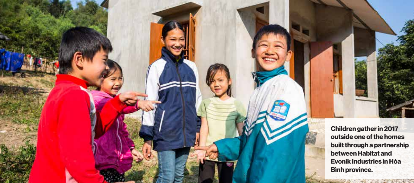
Children gather in 2017 outside one of the homes built through a partnership between Habitat and Evonik Industries in Hòa Binh province.